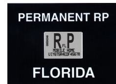
Sample of a Real Property Decal

If you own the land and the mobile home together, you may be entitled to an RP decal. The RP stands for Real Property, which means both the MH and the land are on