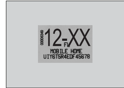
Sample of a MH Registration Decal