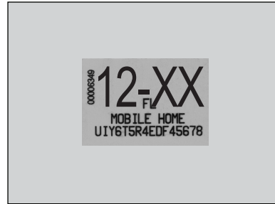
Sample of a MH Registration Decal