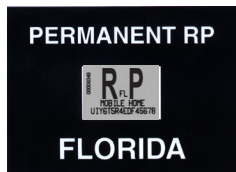
Sample of a Real Property Decal

If you own the land and the mobile home together, you may be entitled to an RP decal. The RP stands for Real Property, which means both the MH and the land are on